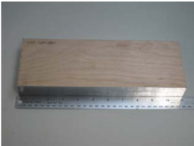
Photo Documentation – The product sample specimen is photographed following specimen preparation. The top and bottom faces of the specimen are photographed.